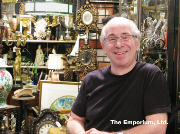
The Emporium, Ltd.