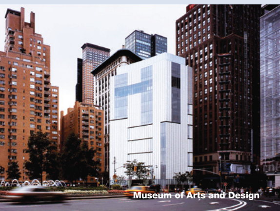
Museum of Arts and Design

And for those looking for a lighter treat, enjoy refreshing low-cal, low-fat Tasti D-lite in its flagship location at Broadway between 60th and 61st Streets. Tasti D-lite is showing off its new, mod look while continuing to provide guilt-free pleasure — creamy, delicious, dairy desserts in more than 100 flavors with the finest natural ingredients.