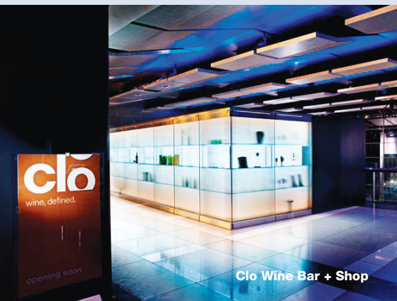
Clo Wine Bar + Shop

Williams-Sonoma Home's new expansion into casually elegant furniture, rugs, lighting and linens at Time Warner Center, www.wshome.com ; and UGG Australia, opening soon at 160 Columbus Avenue, for luxury, fashion and comfort, www.uggaustralia.com .