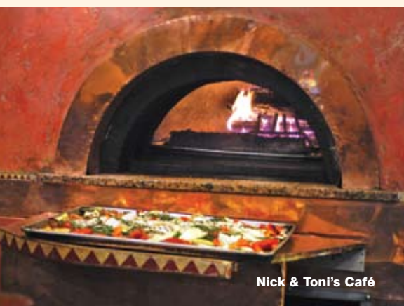
Nick & Toni's Café

Relaxed, elegant, sophisticated. Expect jewel tones in early fall — hot chili, dark pumpkin and garnet. The lavenders and purples of October will complement what you bought in September. And don’t forget the basics — grays, browns and blacks. The mantra is layer, layer, layer — leggings, tanks, tunics, skirts, skinny pants, cardigans, accessories and, to complete the outfit, embroidered and crinkled scarves. European devotees flock to the TWC store to purchase their seasonal wardrobes. You should too!